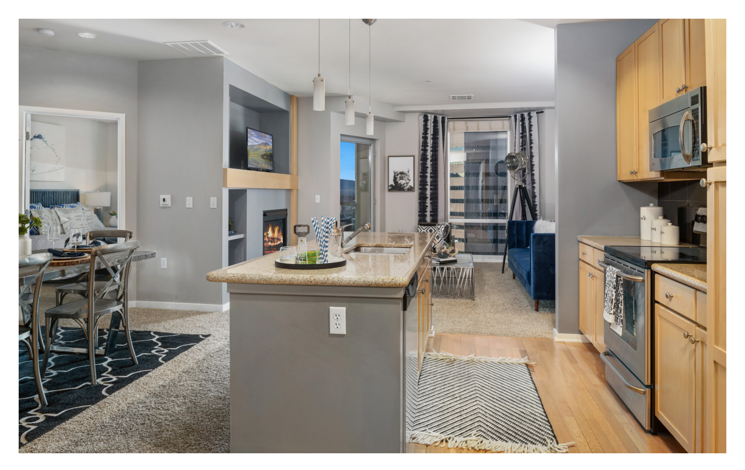
Sky-high living with the city center at your doorstep. Propel your comfort to new heights and make the most of the luxury amenities, huge interiors, and excellent services that put us on the map.