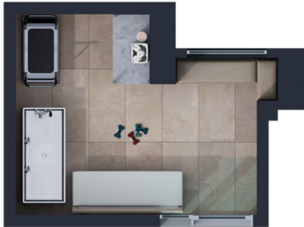
P1 | Pet Spa